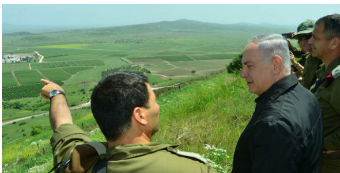
Israeli Prime Minister Benjamin Netanyahu convened the Israeli cabinet for a historic meeting on the Golan Heights in April 2016.

On April 17, 2016, Breaking Israel News reported that on Sunday, April 10, 2016, Israeli Prime Minister Benjamin Netanyahu convened the Israeli Cabinet for the first time ever on the Golan Heights. As the international community began to talk about a settlement to appease Syria in a cease fire of the ongoing civil war in Syria, the world, including some in President Barack Obama's administration, were talking about forcing Israel to surrender the strategic Golan Heights to Syria. In response to this, Prime Minister Netanyahu wanted to send a very strong message to the world. At this Israeli cabinet meeting on the Golan, He said: "I convened this celebratory meeting in the Golan Heights to send a clear message: The Golan will always remain in Israel's hands. Israel will never withdraw from the Golan Heights. ... Whatever happens on the other side of the border, the border itself will not move. Secondly, after 50 years it is time that the international community realized that the Golan will remain under Israeli sovereignty."