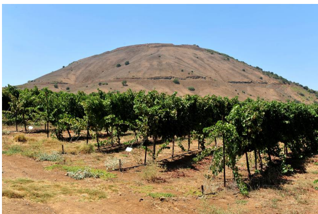
Mount Bental is only one of many dormant volcanoes that dot the landscape of the eastern area of Israel's Golan Heights.

Should Iran provoke Israel again, and Israel retaliate with a strike against Iranian nuclear installations (which the Russians have help Iran develop), will it provoke a response that will lead to Gog and Magog? We are the first generation to ever be able to envision how all of this could unfold. We are living at a time when it is coming to fruition.